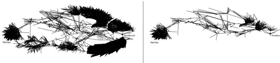
Fig. 3. Comparison of arcs expanded by AllDescents (left) and SingleDescent (right) with no heuristics on a route from Innsbruck to Nantes.

forbidden by some constraints and thus the vertical optimization will not be able to repair and obtain a good quality solution. There are also two instances where the two-phase approach fails to find any solution at all. As far as run-time is concerned, the two-phase approach does entail faster run-times than any of the 3D algorithms with a median of 10 seconds and a worst-case performance of 47 minutes. In general, there are some outliers caused by instances where the vertical optimization has trouble finding a feasible solution causing a large number of restarts. Using the DD heuristic does not yield any relevant effect, while using the CD heuristic does decrease run-time but also worsens the cost of the final path further. CD also increases the number of unsolved instances to 10.